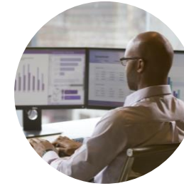
Desk Centric Worker